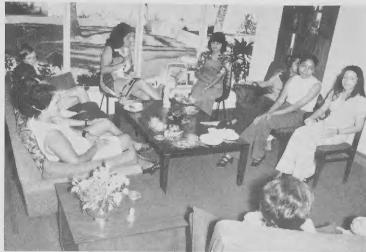
This year's top graduates and their mothers are honored guests at ■ coffee party given by the Aruba Women's Club.